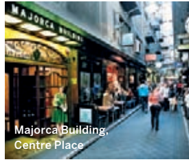
Majorca Building, Centre Place

INSIDER TIP Head to the Melbourne Cricket Ground from 26-30 December and join about 80,000 fellow fans for the Boxing Day Test, the world's biggest match.