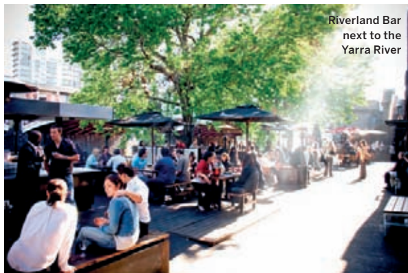
Riverland Bar next to the Yarra River