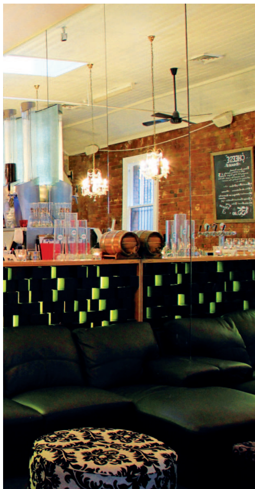
MAIN: At Biero Bar, beer lovers can drink up more beers at a fraction of the usual cost INSET: The enormous Beervaults behind the bar