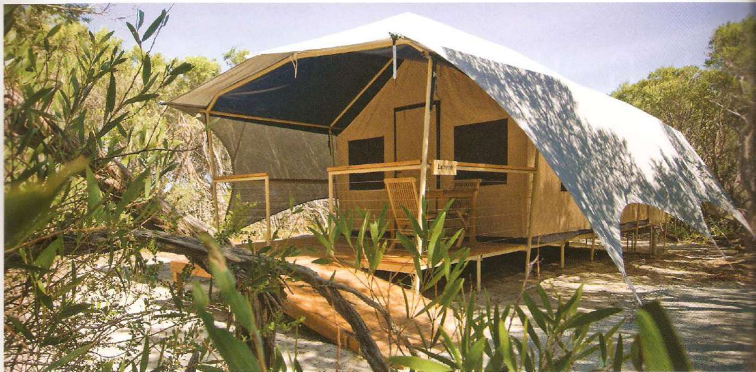
One of Parks Victoria's eco-friendly luxury tents in the tranquil surroundings of Tidal River.