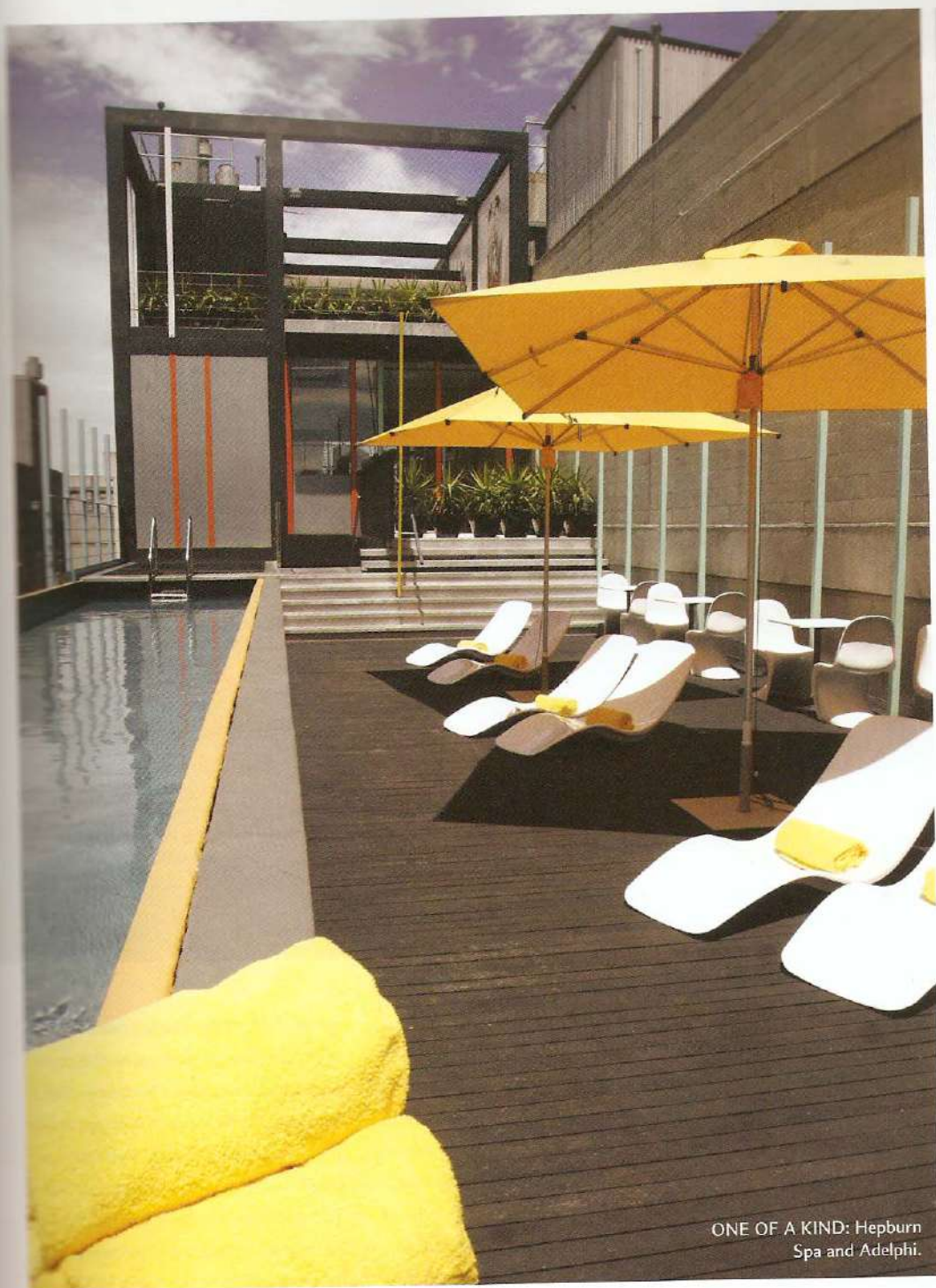
ONE OF A KIND: Hepburn Spa and Adelphi.

special dinners and "educational sessions" in the tasting room phone (03) 9663 4448 or go to lavitabuona.com.au .