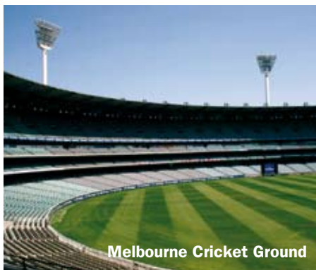
Melbourne Cricket Ground