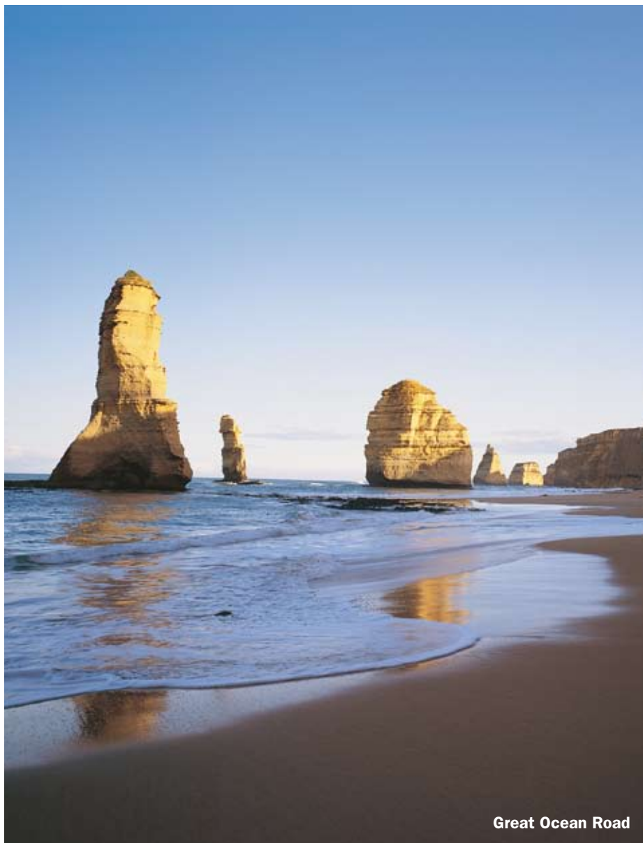
Great Ocean Road