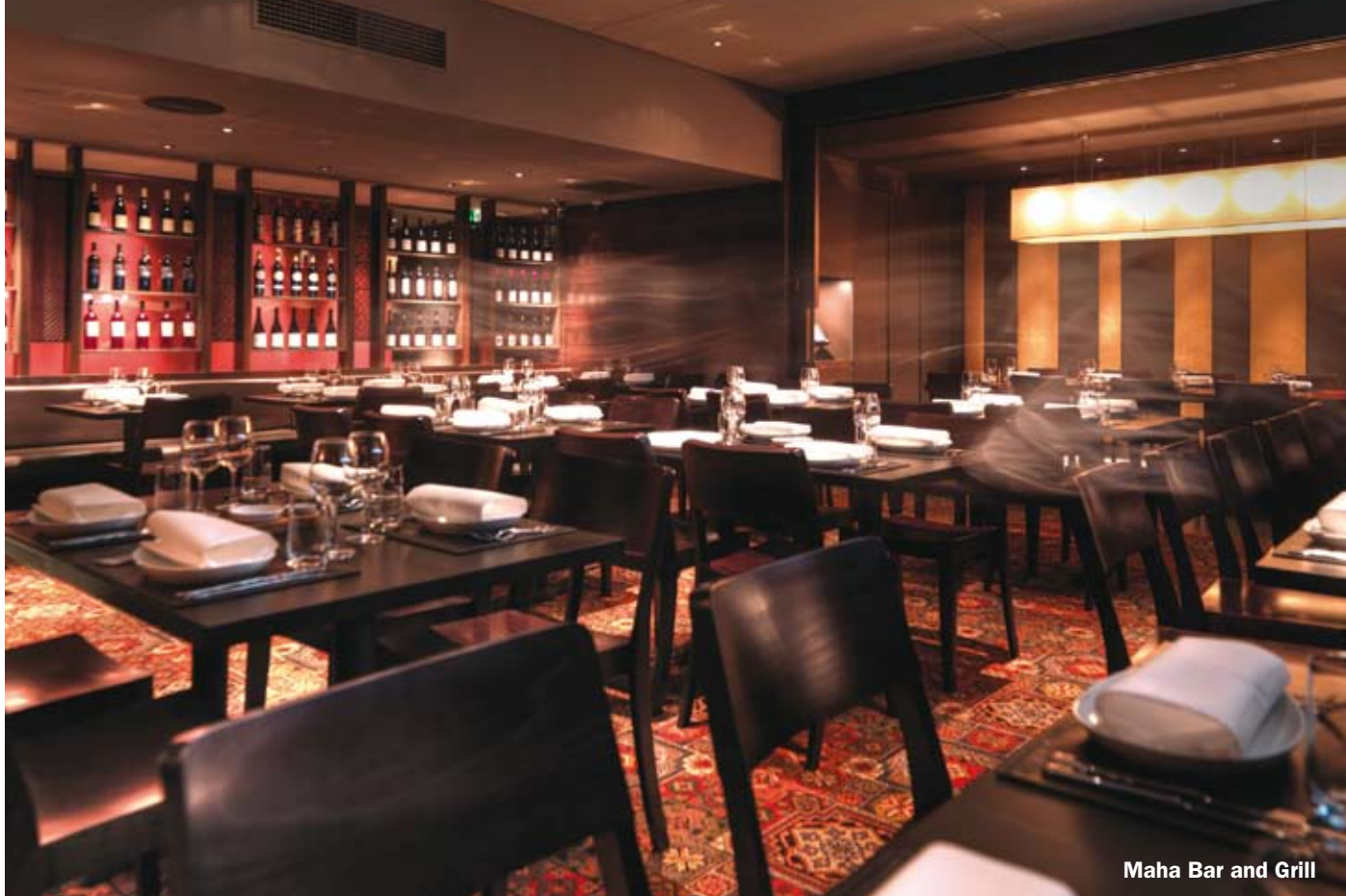
Maha Bar and Grill